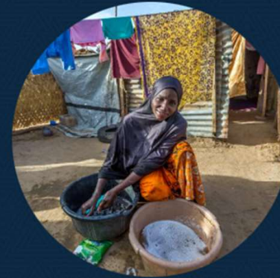
Providing Clean Water