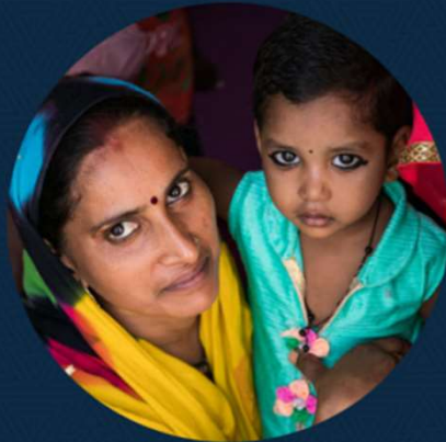
Saving Mothers & Children